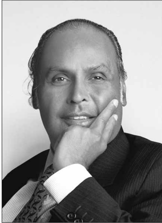
Padma Vibhushan Shri Dhirubhai H. Ambani (28 th December, 1932 - 6 th July, 2002) Reliance Group - Founder and Visionary